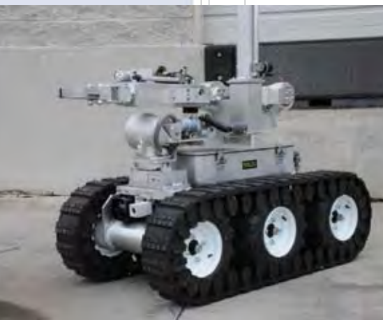
Vertical / Horizontal Extension and Weight Capacities

The Remotec ANDROS Wolverine is the workhorse robot that won't quit until you do. This heavy-duty, all-terrain robot brings superior strength and manipulator dexterity to your longest, most intense missions.